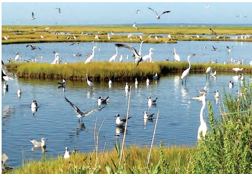
Figure 3. MUMMICHOG AS FOOD. Large numbers of birds aggregate on the salt marsh surface around ponds or pools to feed on mummichogs, especially in the early mornings in the summer.

However, a general warning to bait fishermen – don't eat them live. Several years ago there was a well-documented account of some fishermen in Maryland who, after a hot day in the sun, retired to a local bar, where they decided to