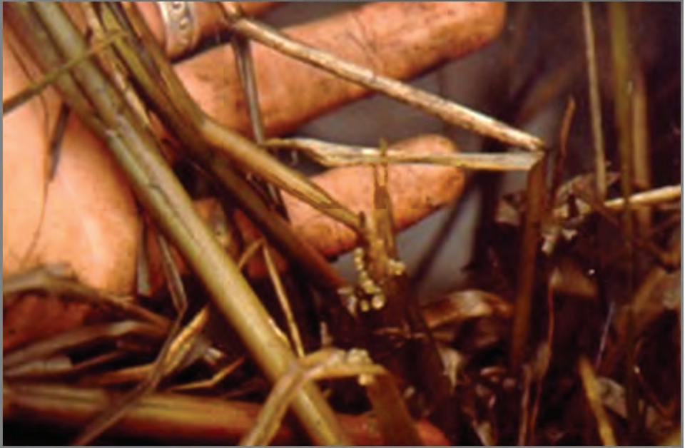
Figure 4. EGGS OF MUMMICHOGS. The fertilized eggs of the mummichog are deposited in intertidal sites including inside the empty valves of ribbed mussel shells (top). These are typically found still partially buried in the marsh mud. The eggs are inserted between the valves and on top of the mud. In this shell there are two masses of eggs, of slightly different colors and development stage. The other common site is at the base of marsh grass leaves (bottom) during spring and new moon tides when the waters are higher and for a longer period.