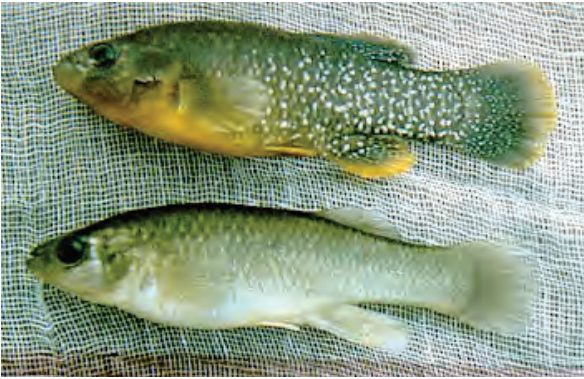
Figure 1. MOST IMPORTANT FISH IN THE MARSH. Spawning coloration of male (top) and female (bottom) mummichogs, typically 2 to 4 inches, is evident during the period of reproduction from late spring through early summer.

recognition of menhaden as “the most important fish in the sea,” Fundulus heteroclitus is crucial to coastal waters, including estuaries and salt marches. While often referred to as “minnow” or “killifishes,” mummichog is the