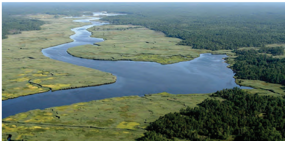
Figure 2. MUMMICHOG HABITAT. The extensive salt marshes in the Mullica Valley provide large areas for the mummichog to complete its life history. This also occurs anywhere along the east coast of the U.S. where there are salt marshes even in heavily urbanized areas such as Upper New York Harbor.